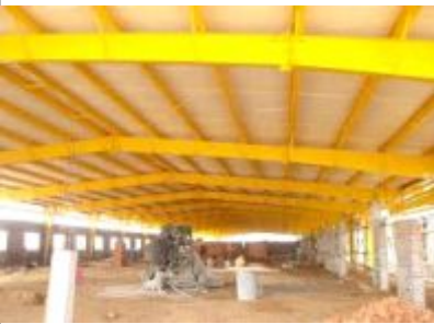
Pre Engineered Building (PEB)